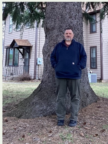
Other Conifers: Norway Spruce, 141" Brad Stevensen