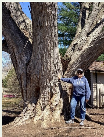
Forest Giants: Silver Maple, 289" Lorna Wille