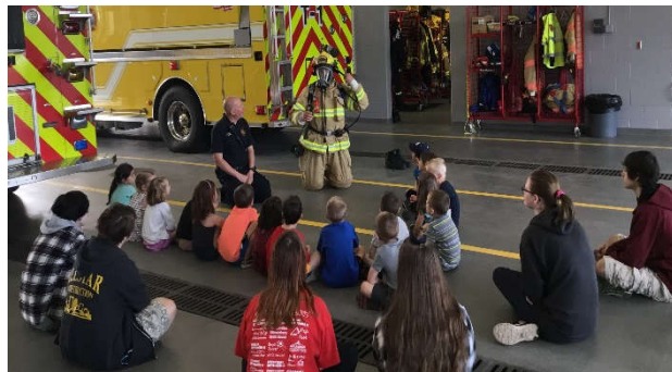
Fire Safety Camp