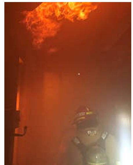
Live Burn Training

46 of the 178 calls for service were overlapping = 26% of the call volume